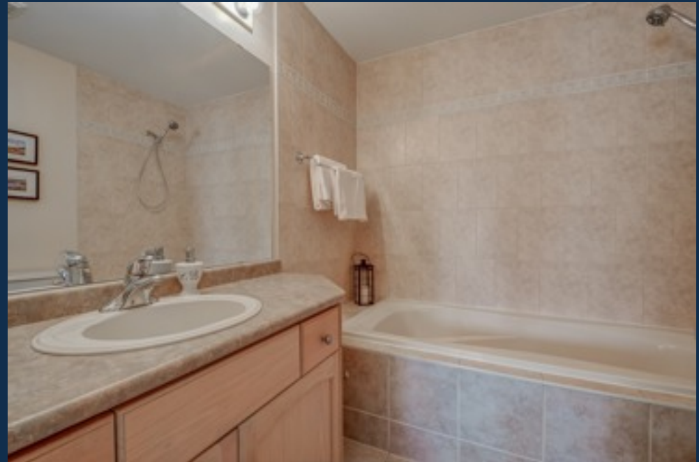
Master bedroom & ensuite