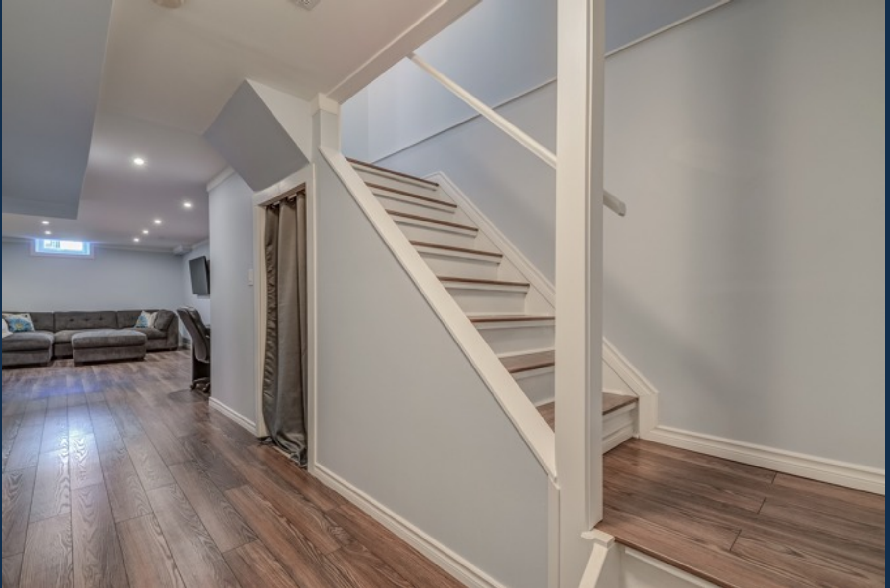
Stairs to basement & recreation room