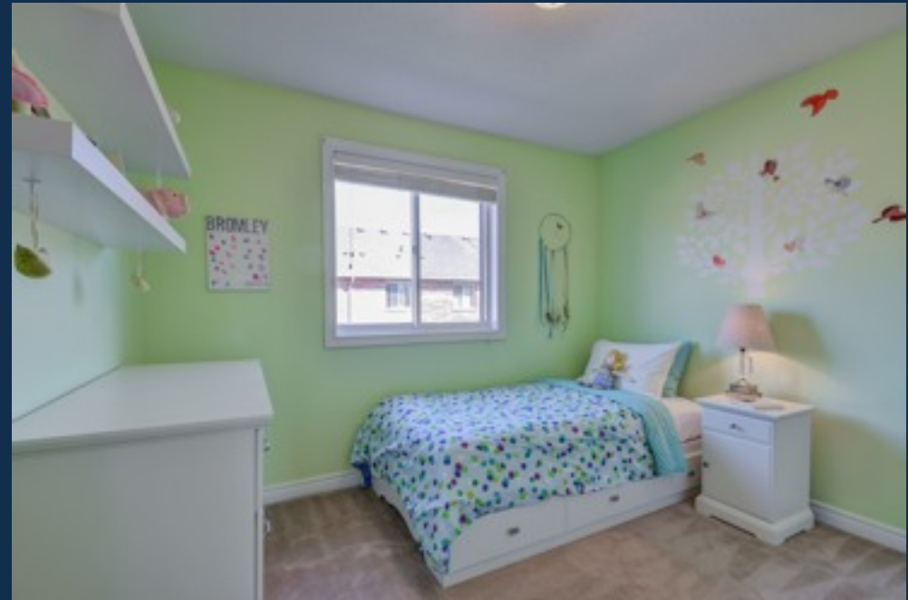
Bedrooms 2 & 3