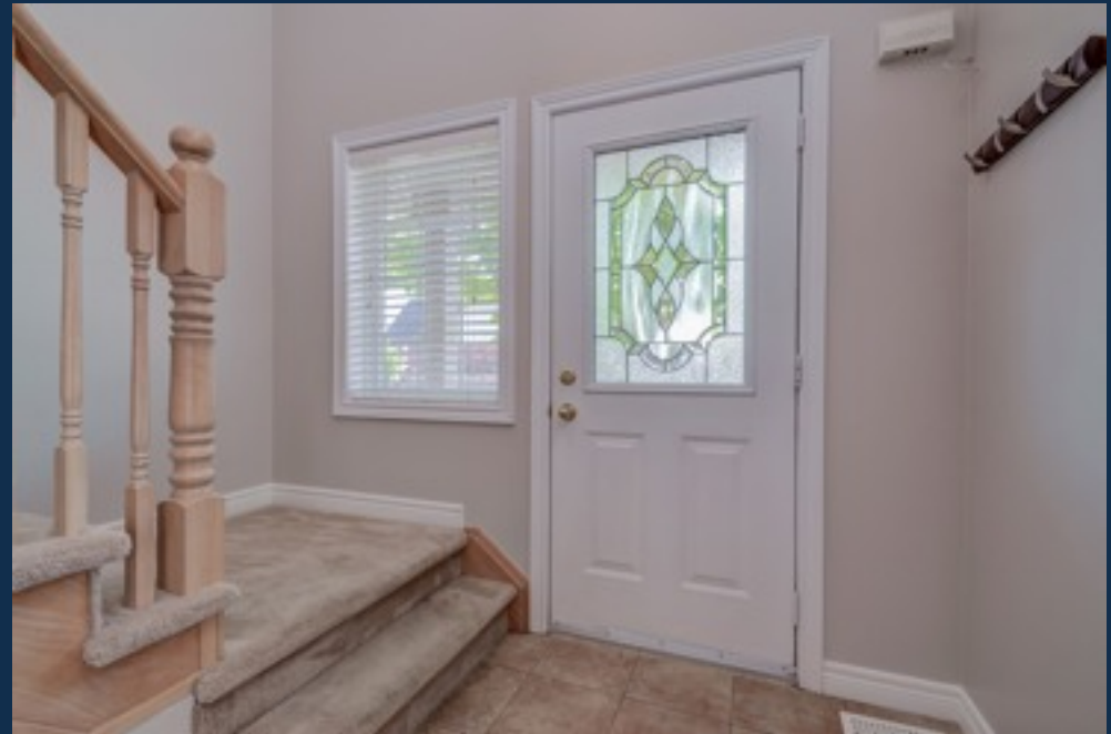
Front entrance & foyer