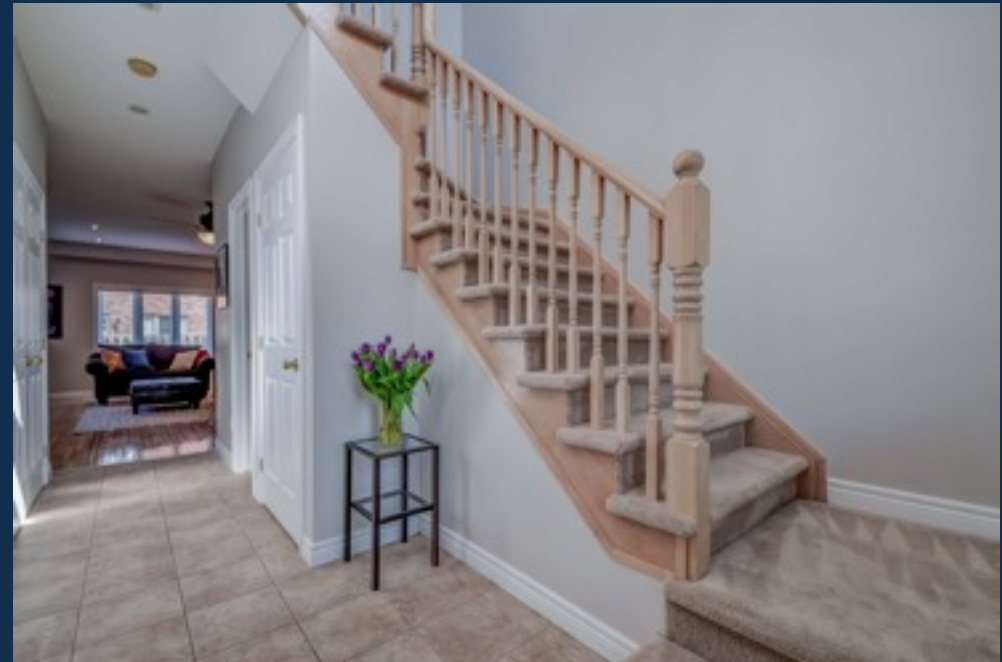
Powder room & stairs to 2nd floor