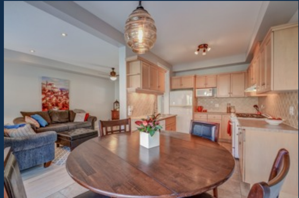
Dining room & kitchen