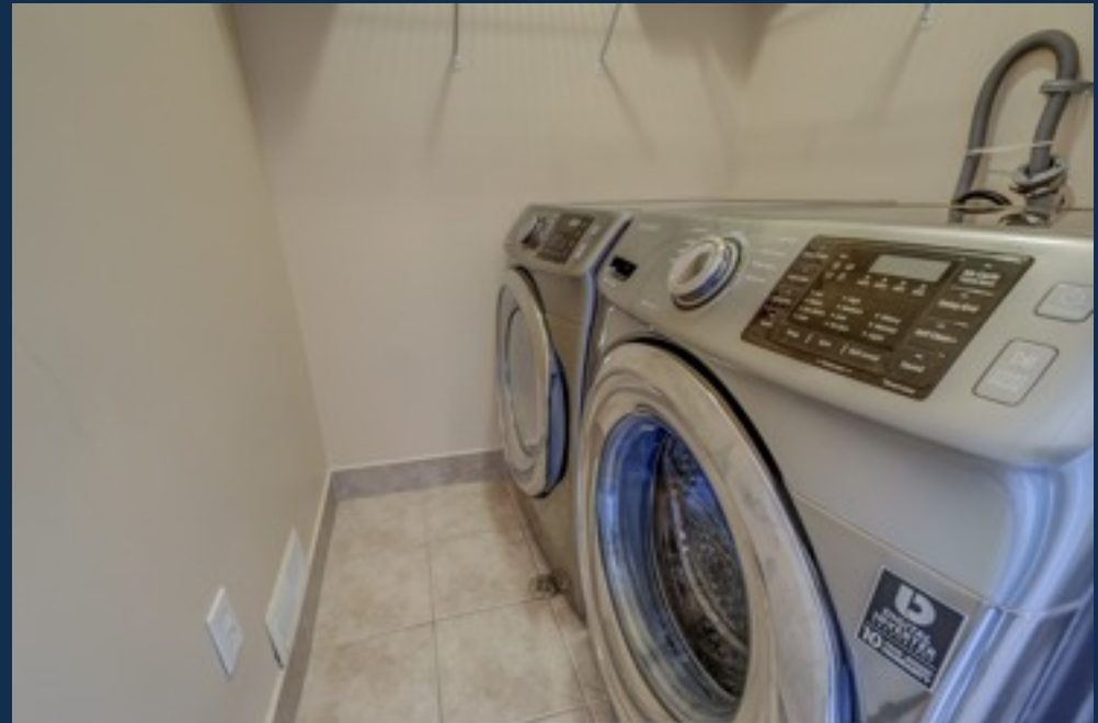
Main bathroom & 2nd floor laundry