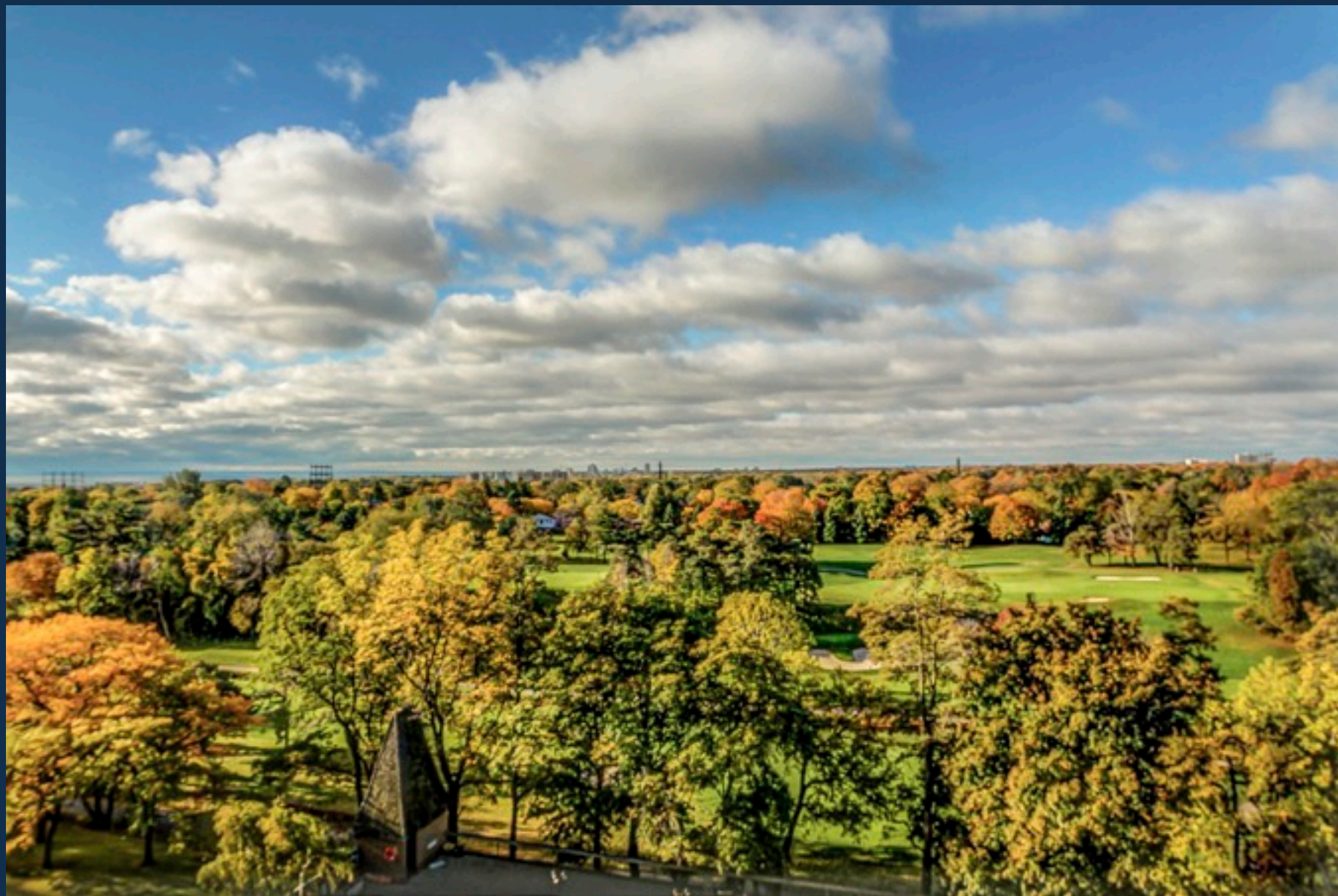
Western View From Suite