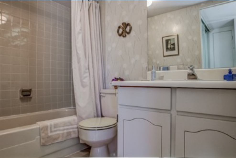
Master Bedroom with 4 Piece Ensuite