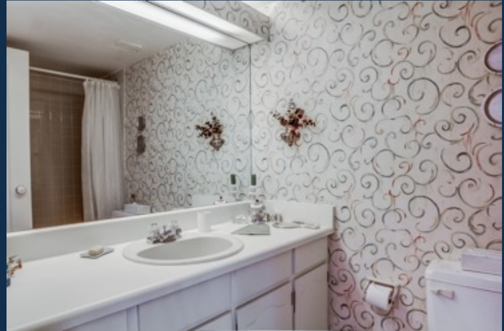
4 Piece Main Bathroom