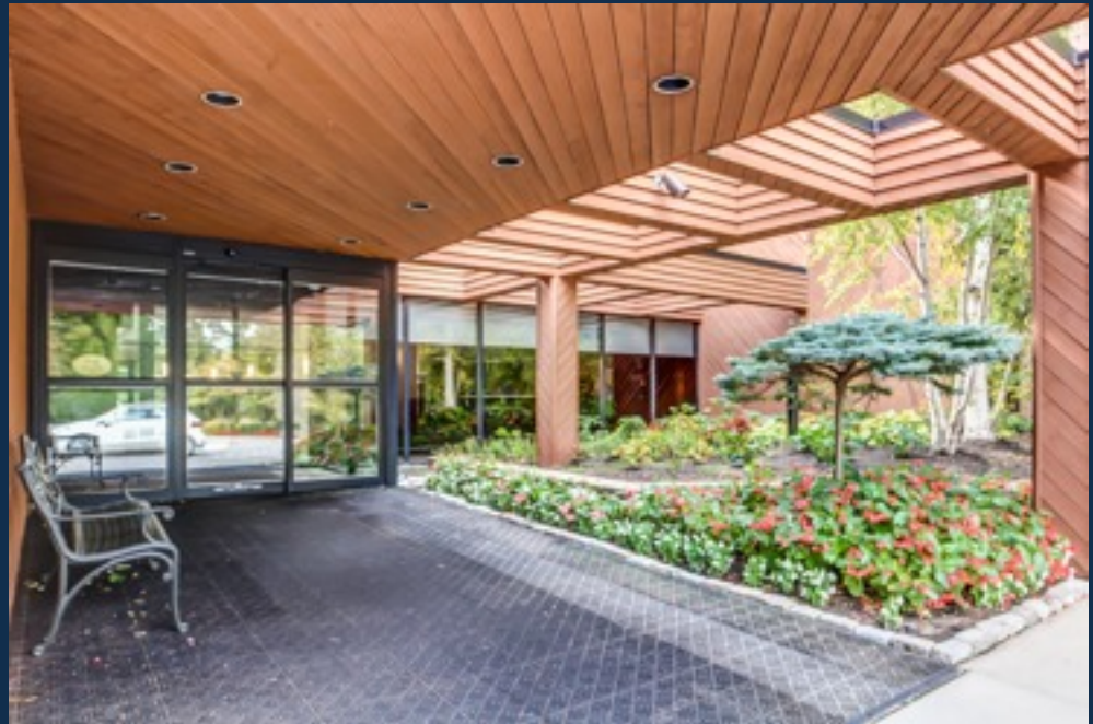
The Fairways - Entrance