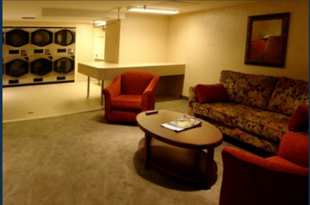
The Fairway - Amenities