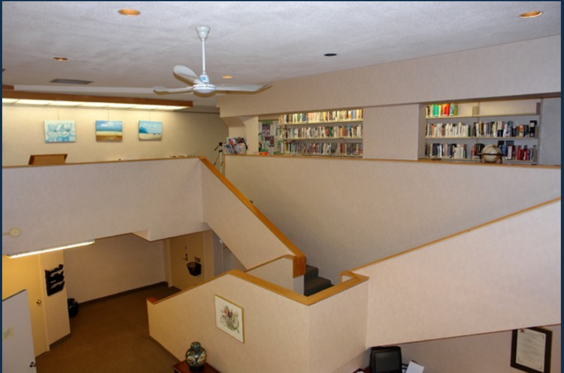
The Fairways - Library