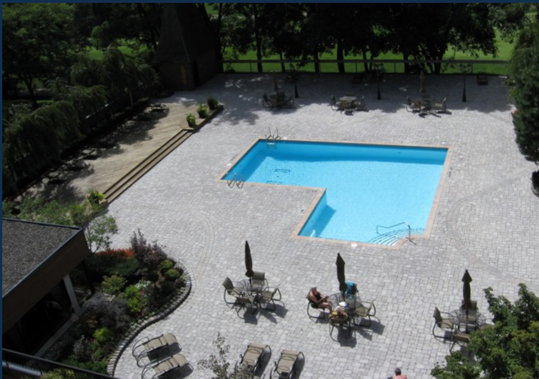
The Fairway - In Ground Pool & Patio