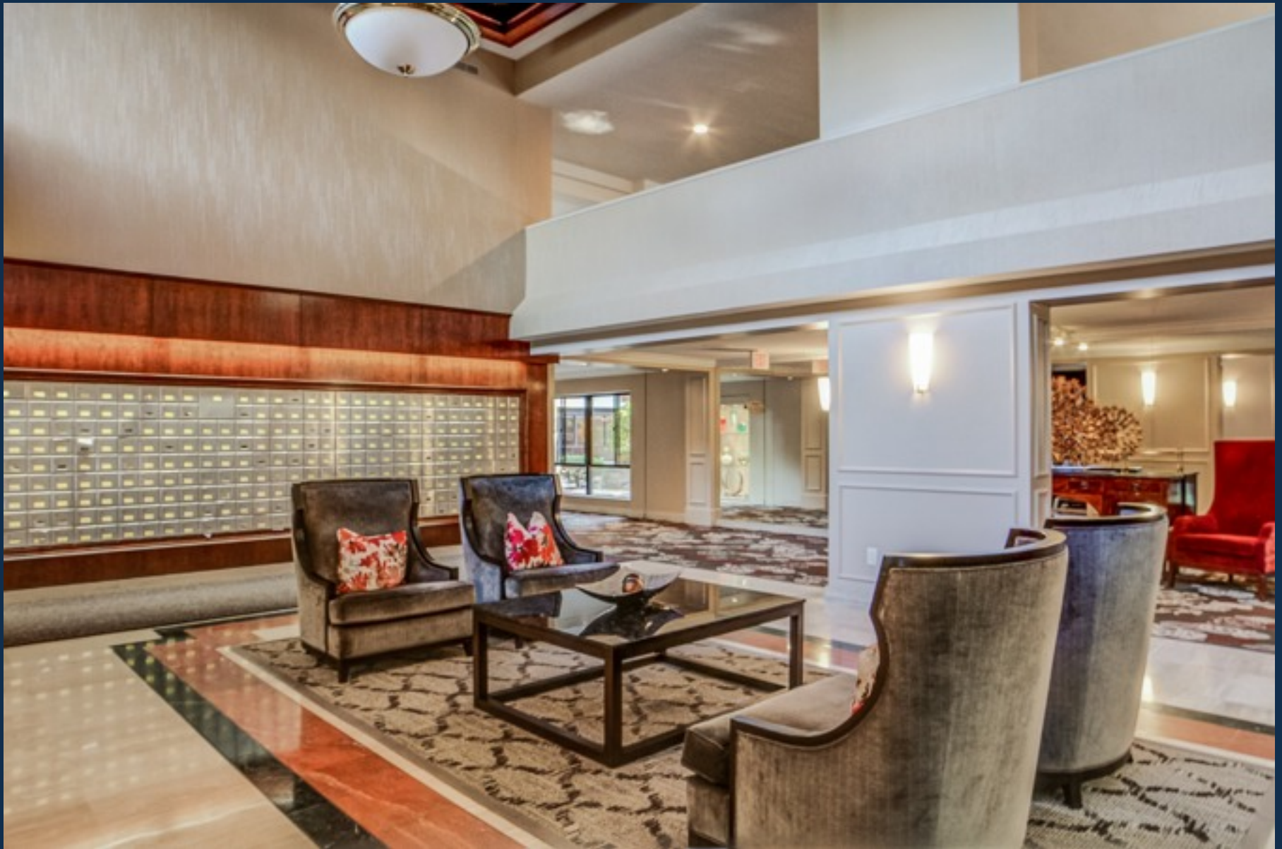
The Fairways Foyer