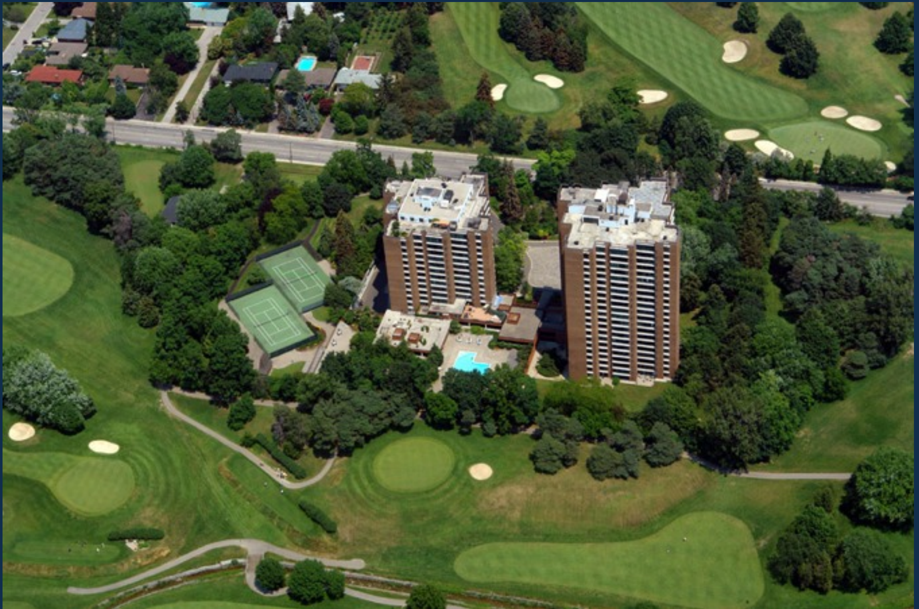
The Fairway - 6 Acres of Land Nestled Between Two Golf Courses